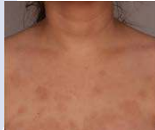
1 month after one treatment