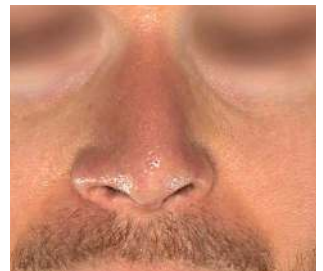
After 3 treatments