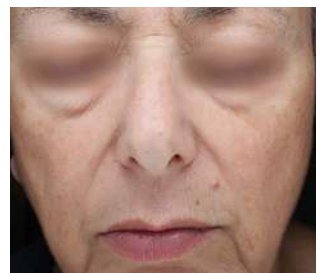
Photofractional™ treatment (Sequential treatment of IPL + ResurFX™) In-house clinic